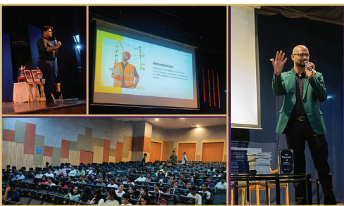
First Year B.Tech Induction Programme "प्रेरणम 2025"