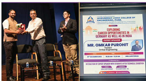
Career Opportunities Session- Germany & India