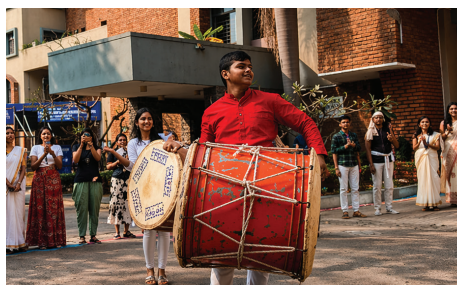
Opening Ceremony of Kalaaranya