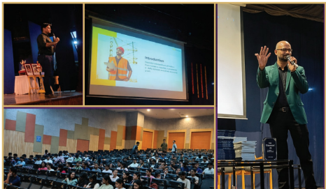
First Year B.Tech Induction Programme "प्रेरणम् 2025"