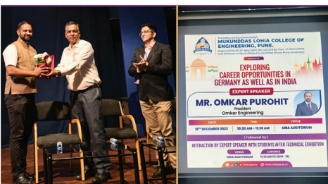
Career Opportunities Session- Germany & India